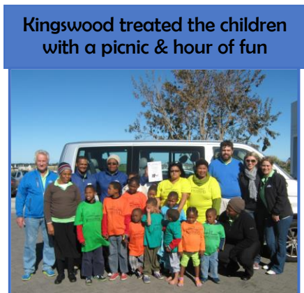
Kingswood treated the children with a picnic & hour of fun