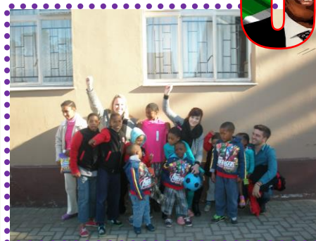
Tramonto made sure each child has a warm top