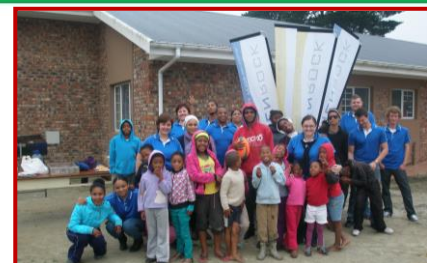
Lumenrock had a braai for the kids & spent time with them

PLEASE VISIT OUR NEW & IMPROVED WEBSITE: