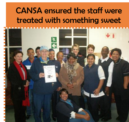
CANSA ensured the staff were treated with something sweet