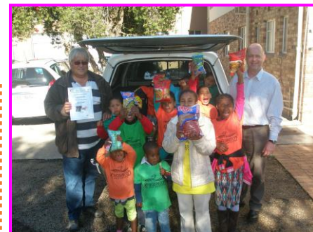
Landbank donated food items to Bethesda