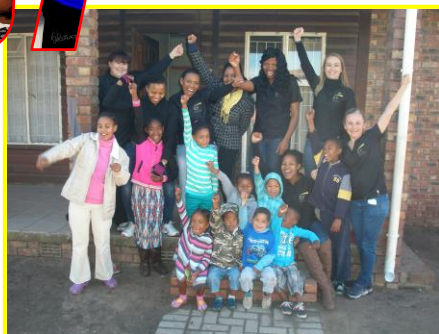
Ernst & Young treated the children & spent time with them