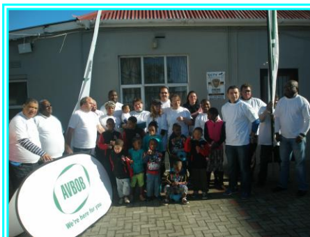
AVBOB painted the outside walls of Wikkeldurms